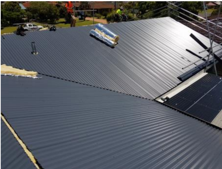
INSULATION LAID UNDER SHEETING