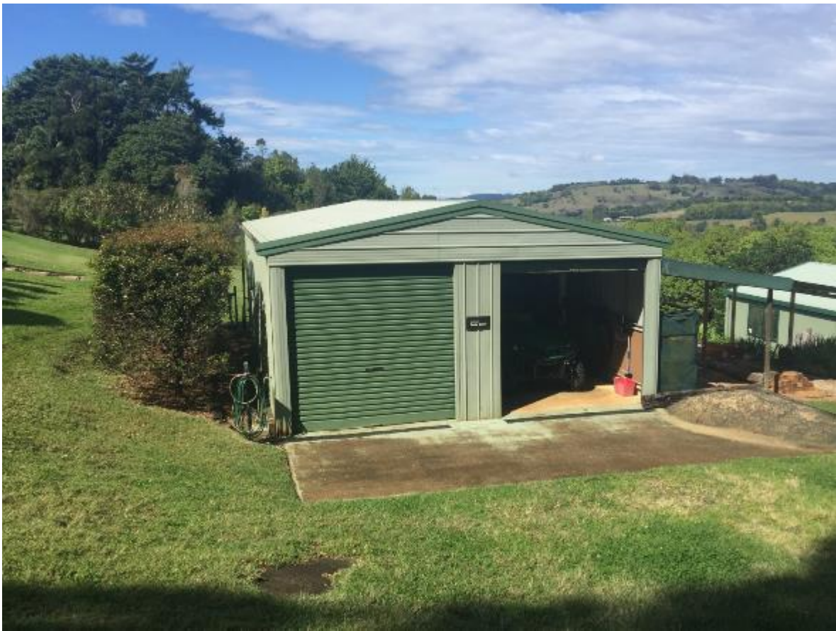
shed before to right