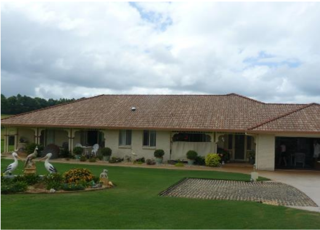
Before colour coat