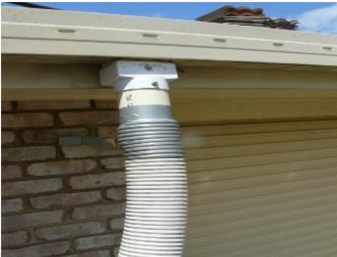
Attach temporary downpipe when necessary