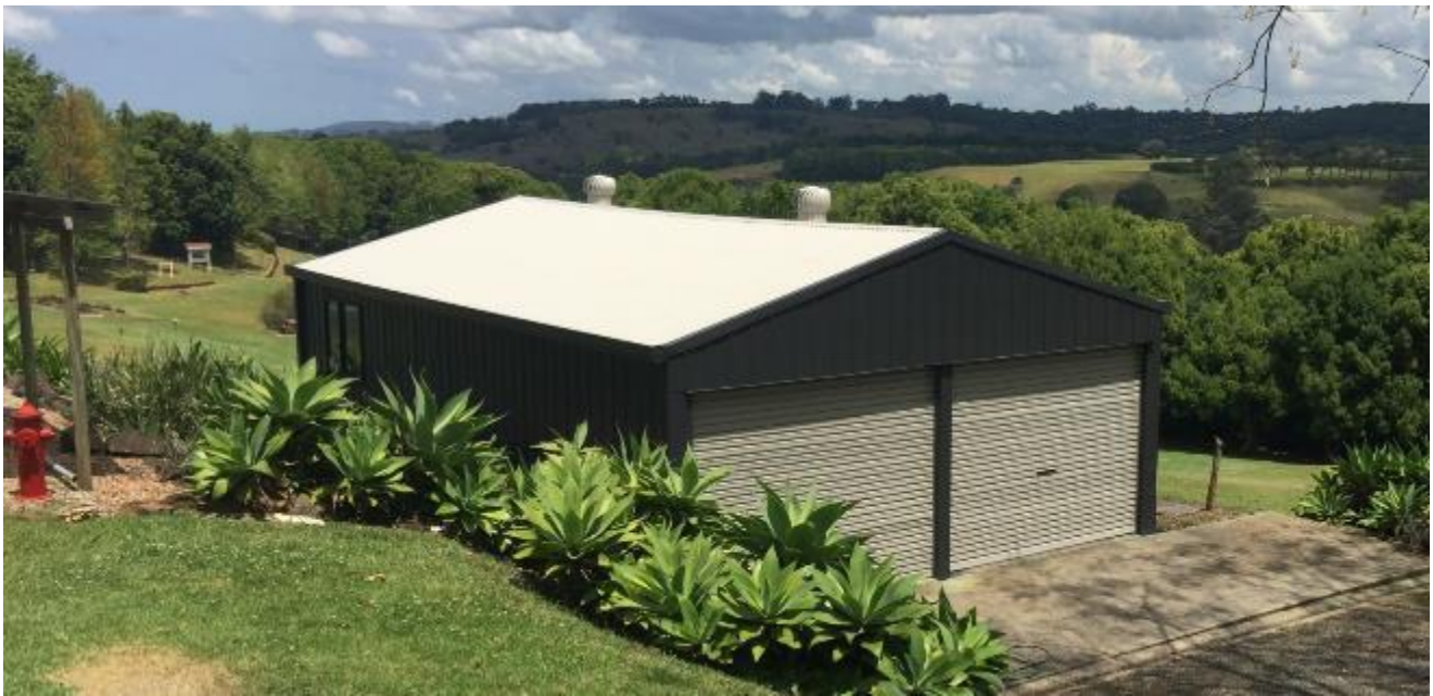
shed after with whirly birds installed

2/32 Southern Cross Drive, BALLINA NSW PO Box 170, Lennox Head NSW 2478 6681 1793