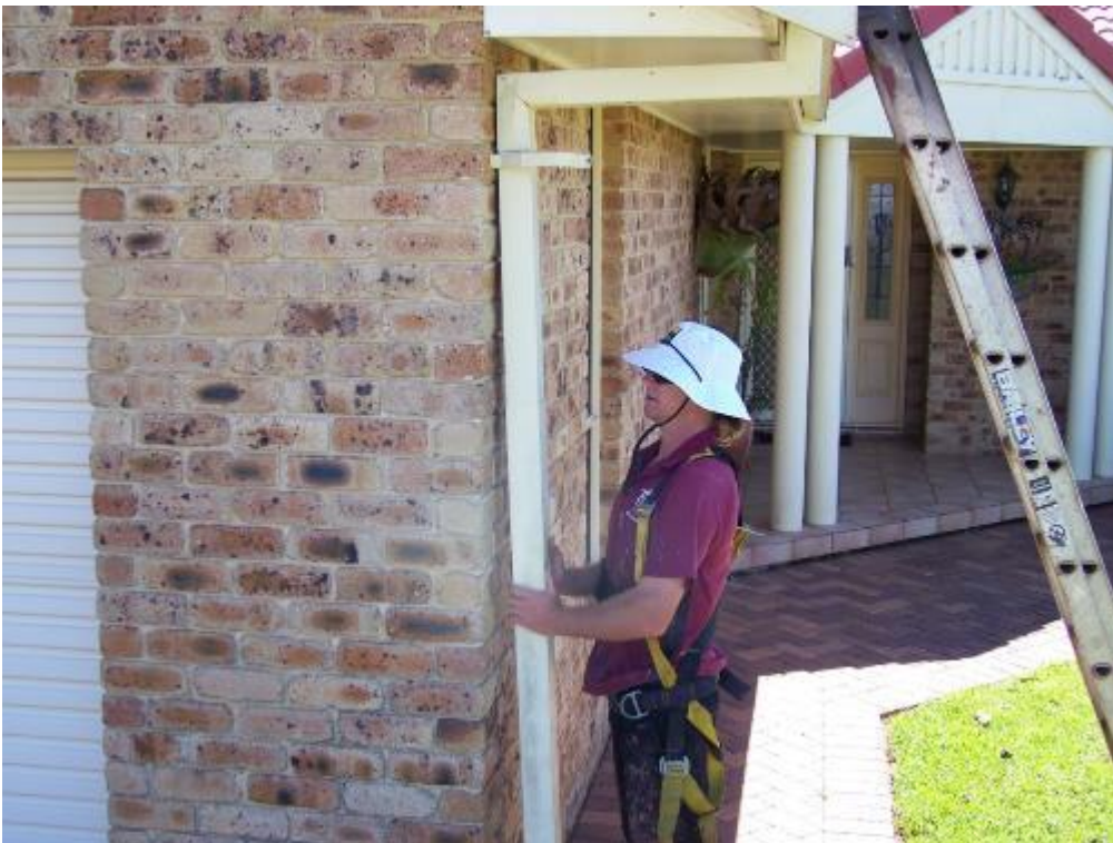
Clean finished gutters reattached

2/32 Southern Cross Drive, BALLINA NSW PO Box 170, Lennox Head NSW 2478 6681 1793