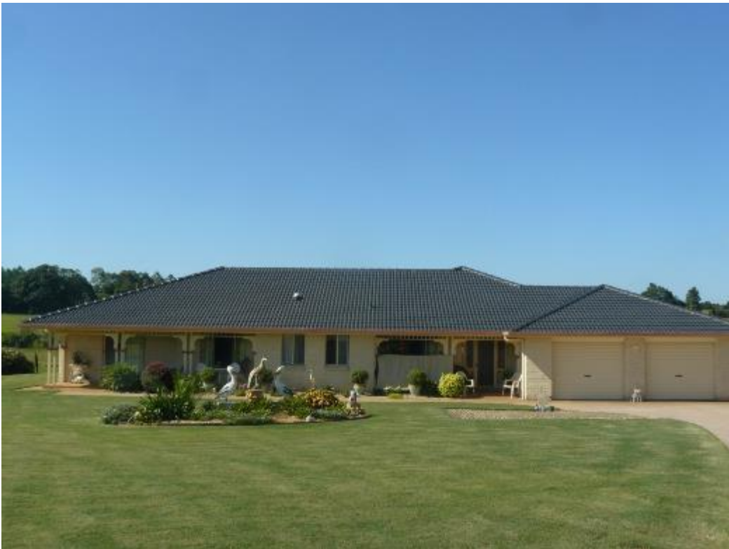
Colour coat completed

2/32 Southern Cross Drive, BALLINA NSW PO Box 170, Lennox Head NSW 2478 6681 1793