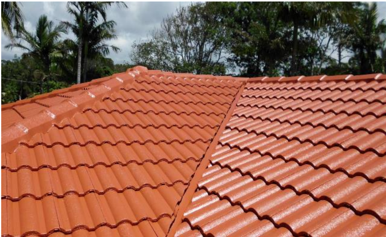
2 nd Colour coat completed