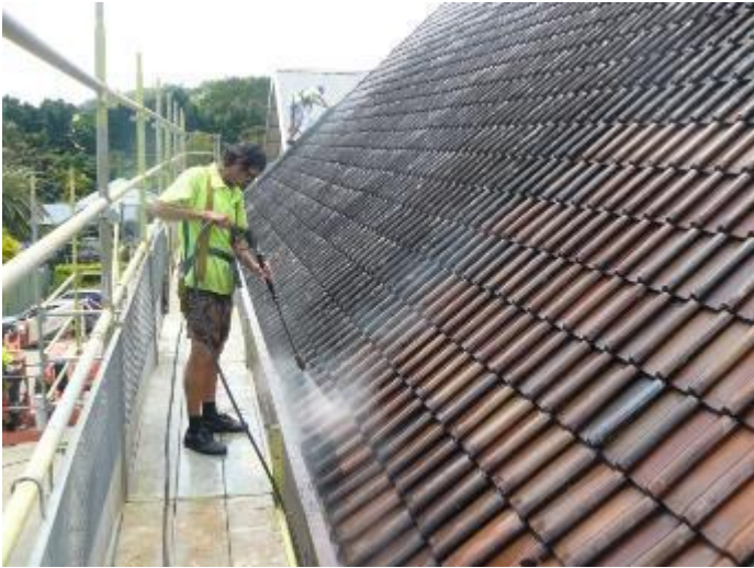
High pitch thus scaffold and cherry picker used