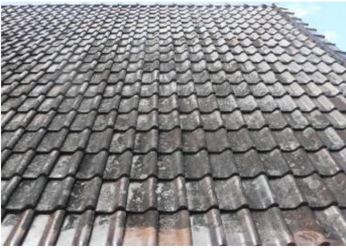
Seventh Day Adventist Church Lismore before cleaning