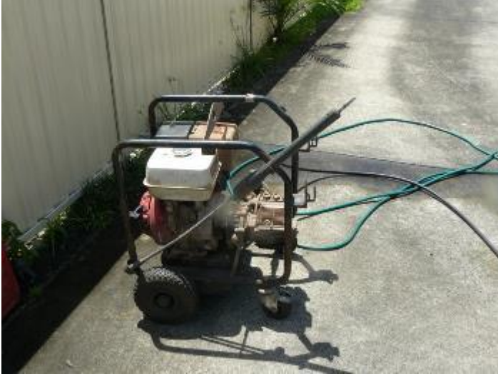
Pressure Cleaning Machine 4000psi