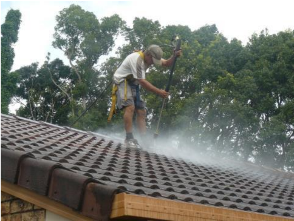
Process commences cleaning

2/32 Southern Cross Drive, BALLINA NSW PO Box 170, Lennox Head NSW 2478 6681 1793