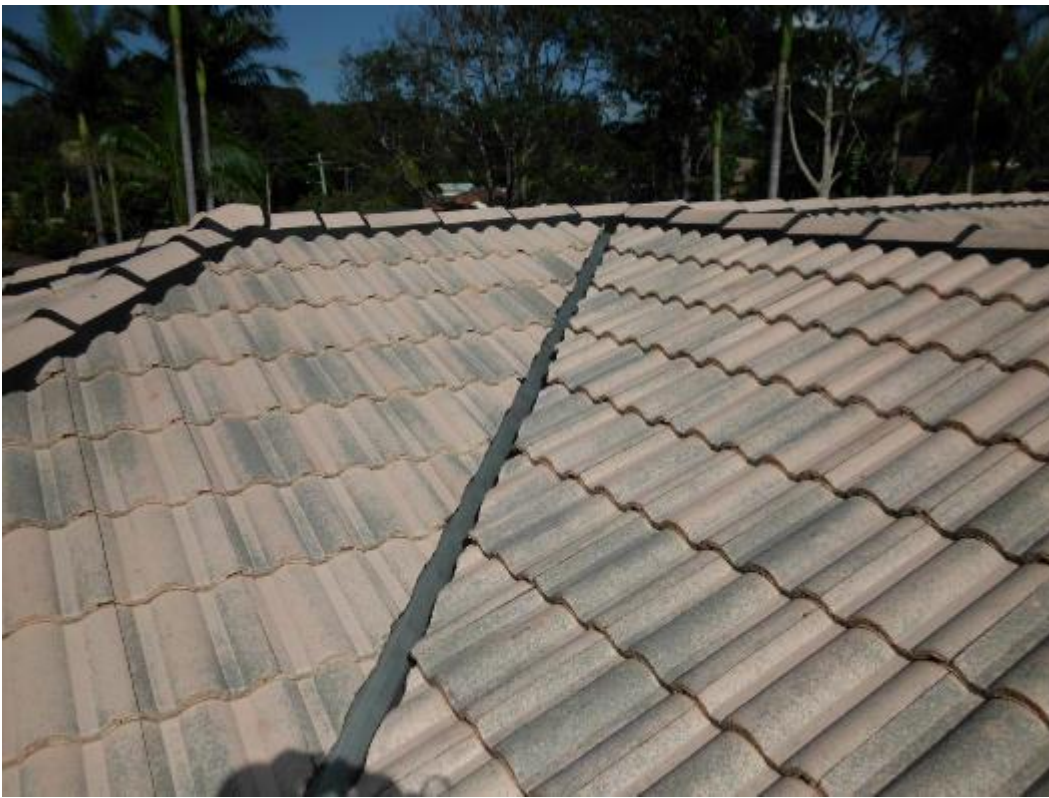
Pointed and sealer coat