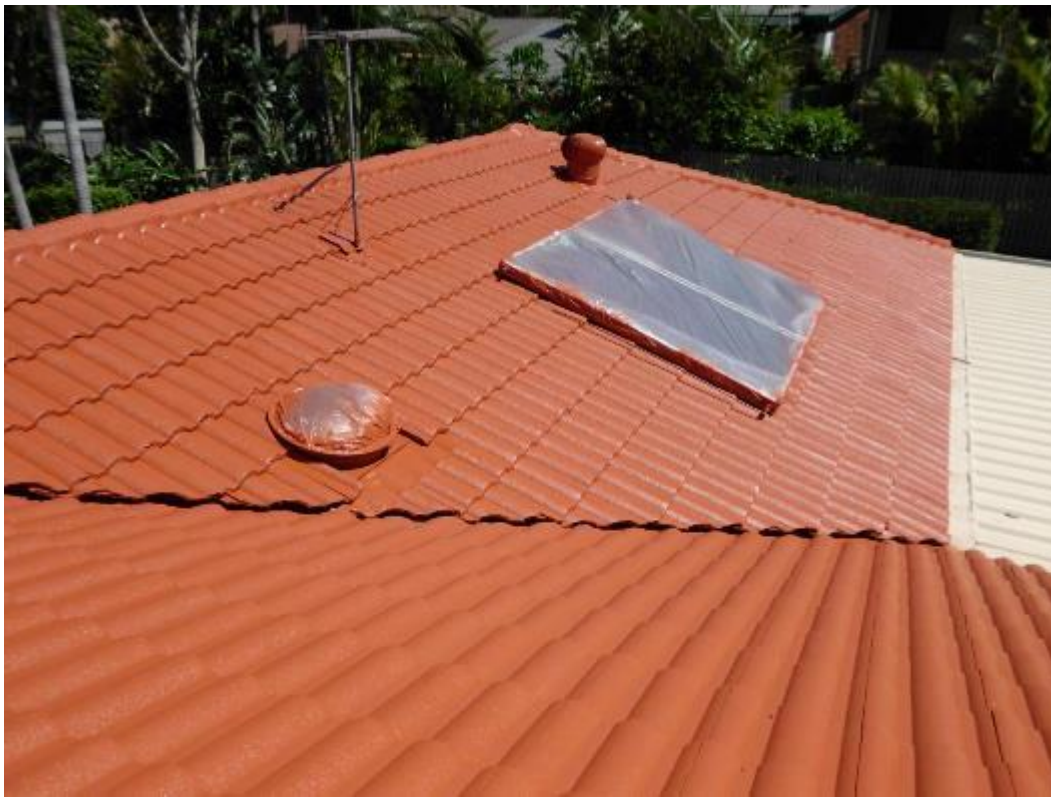
1 st coat