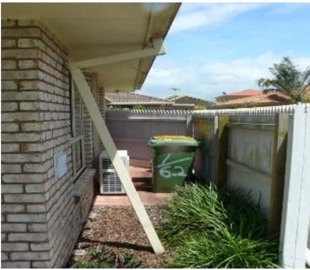
Downpipes disconnected prior to cleaning