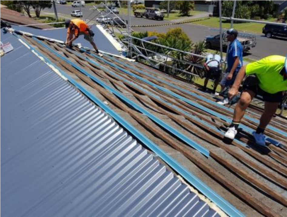
METAL BATTERNS INSTALLED