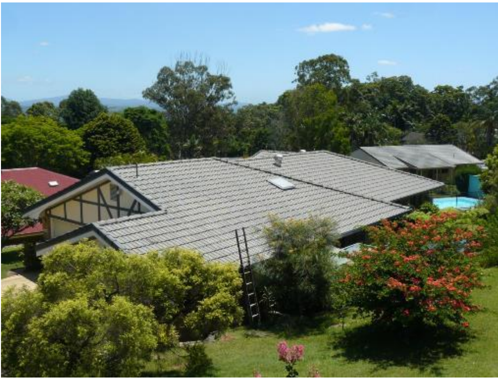
Before colour coat