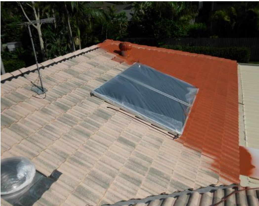
Solar covered 1 st coat

2/32 Southern Cross Drive, BALLINA NSW PO Box 170, Lennox Head NSW 2478 6681 1793