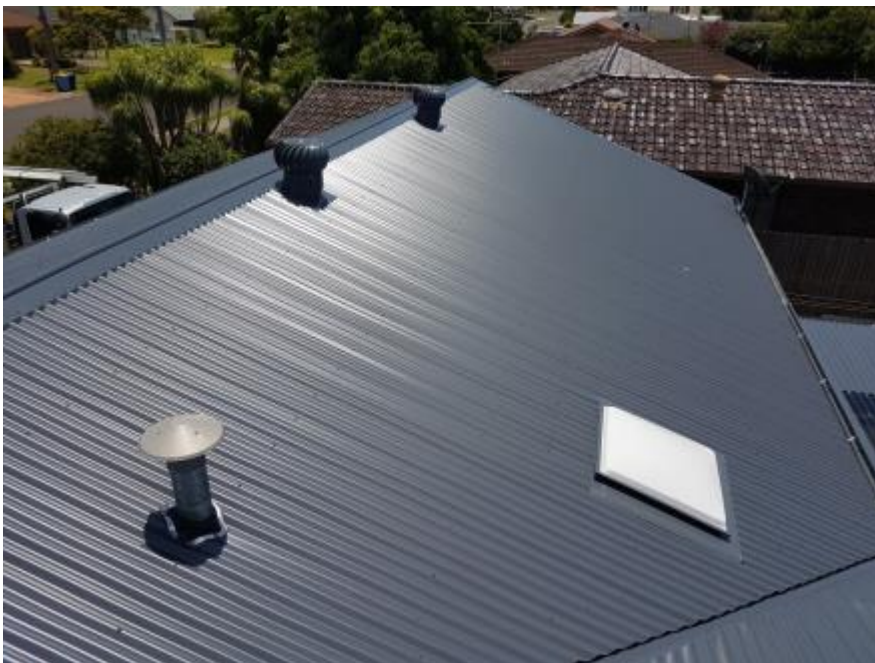
SKYLIGHT, WHIRLY BIRDS and FLU

2/32 Southern Cross Drive, BALLINA NSW PO Box 170, Lennox Head NSW 2478 6681 1793